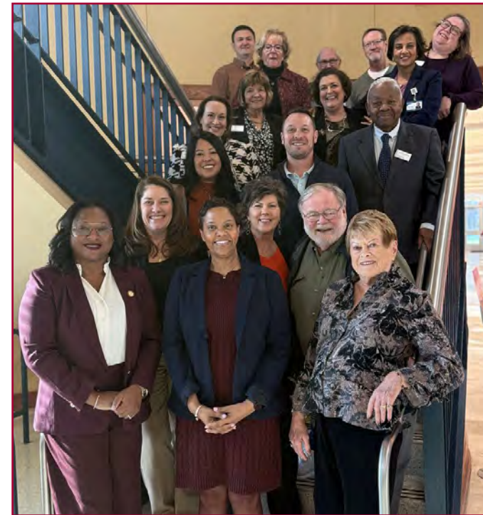
Meet and greet with the Germanna Educational Foundation board members and friends of Germanna.