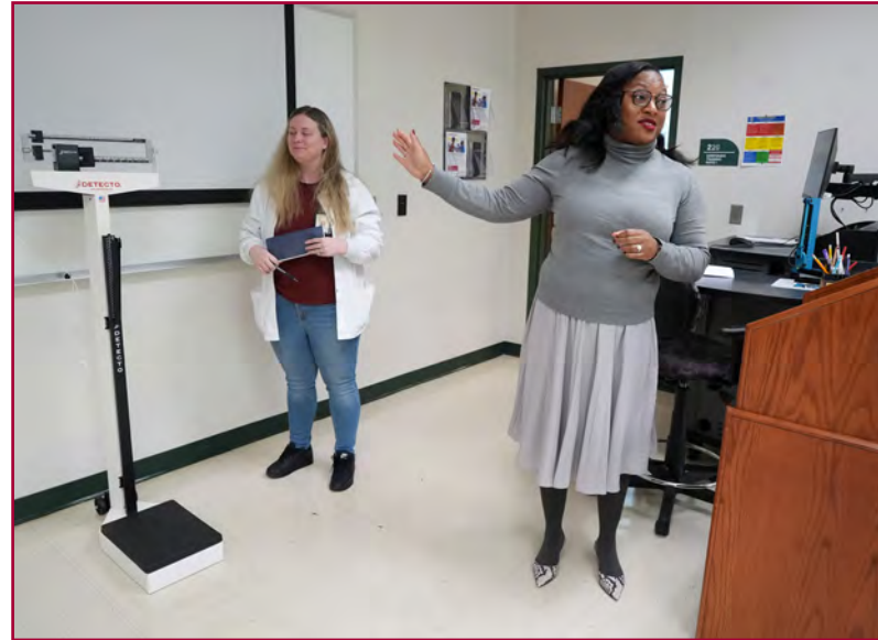
Meet and greet with students and faculty on the first day of spring 2026 classes.

Toured all Germanna locations and met with faculty, staff, and students • Delivered welcome remarks at Faculty Professional Development Day and Spring Student Welcome Day • Connected with students and faculty across campuses on the first day of classes • Participated in Faculty Senate to hear faculty perspectives • Held meet-and-greet conversations across campuses