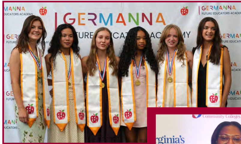
Future Educators Academy students.