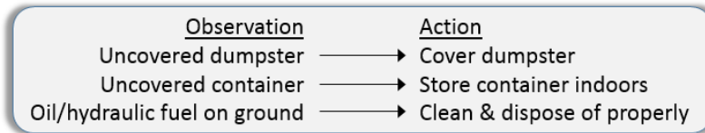
Figure 2. Example daily observations and subsequent actions that can prevent an illicit discharge.

Potential illicit discharges can be identified and removed prior to entering the storm sewer with effective inspections and appropriate follow-up when pollutants appear to be potentially exposed to precipitation, and subsequently, stormwater runoff. GCC’s maintenance and operations staff are in the best position to identify these pollutants such as those identified in Table 1. Figure 2 provides several examples of the observations and actions that could prevent an illicit discharge. If the observer is not qualified or appropriately trained to take the appropriate action, or if illegal dumping is observed, notify the GCC Facilities Director or designee.