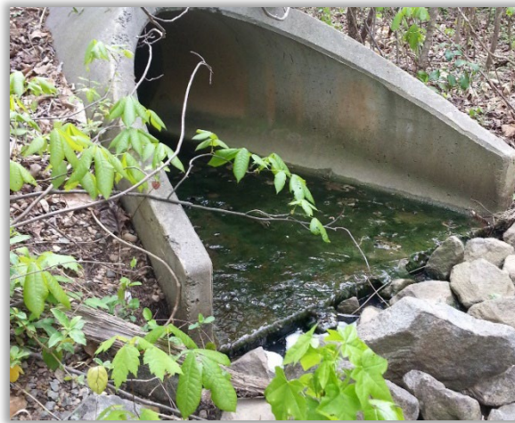
Figure 3. Example Photo showing algae growth.